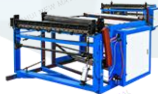
② Cutting Machine