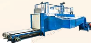
⑥ Heating Oven