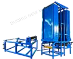
① Resin Machine