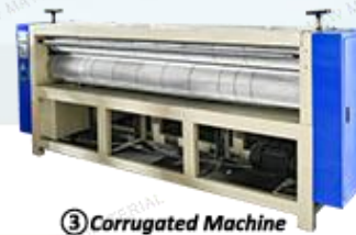
③ Corrugated Machine