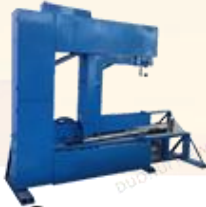
⑦ Sawing Machine