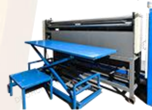
⑤ Gluing Machine

Duohui Evaporate Cooling Pad Production Line Machinery is specialized in producing the cooling pad. It includes resin machine, cutting machine, corrugated machine, heating & forming machine, gluing machine, oven/solidifying machine, sawing machine, polishing machine, blending machine and electrical equipment.