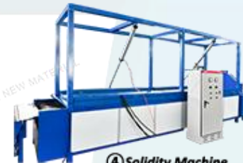
④ Solidity Machine